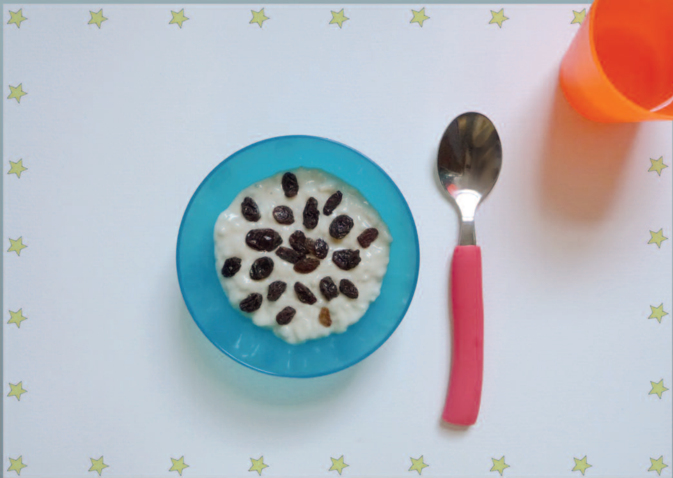
DESSERT Rice pudding with sultanas