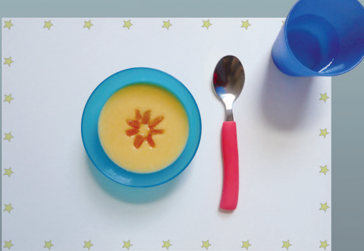
DESSERT Apricot fool with chopped apricot