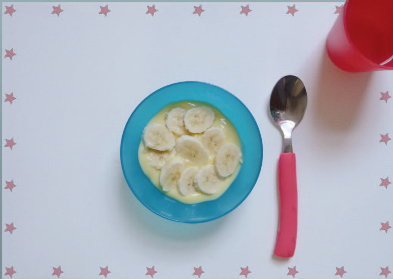
DESSERT Banana custard