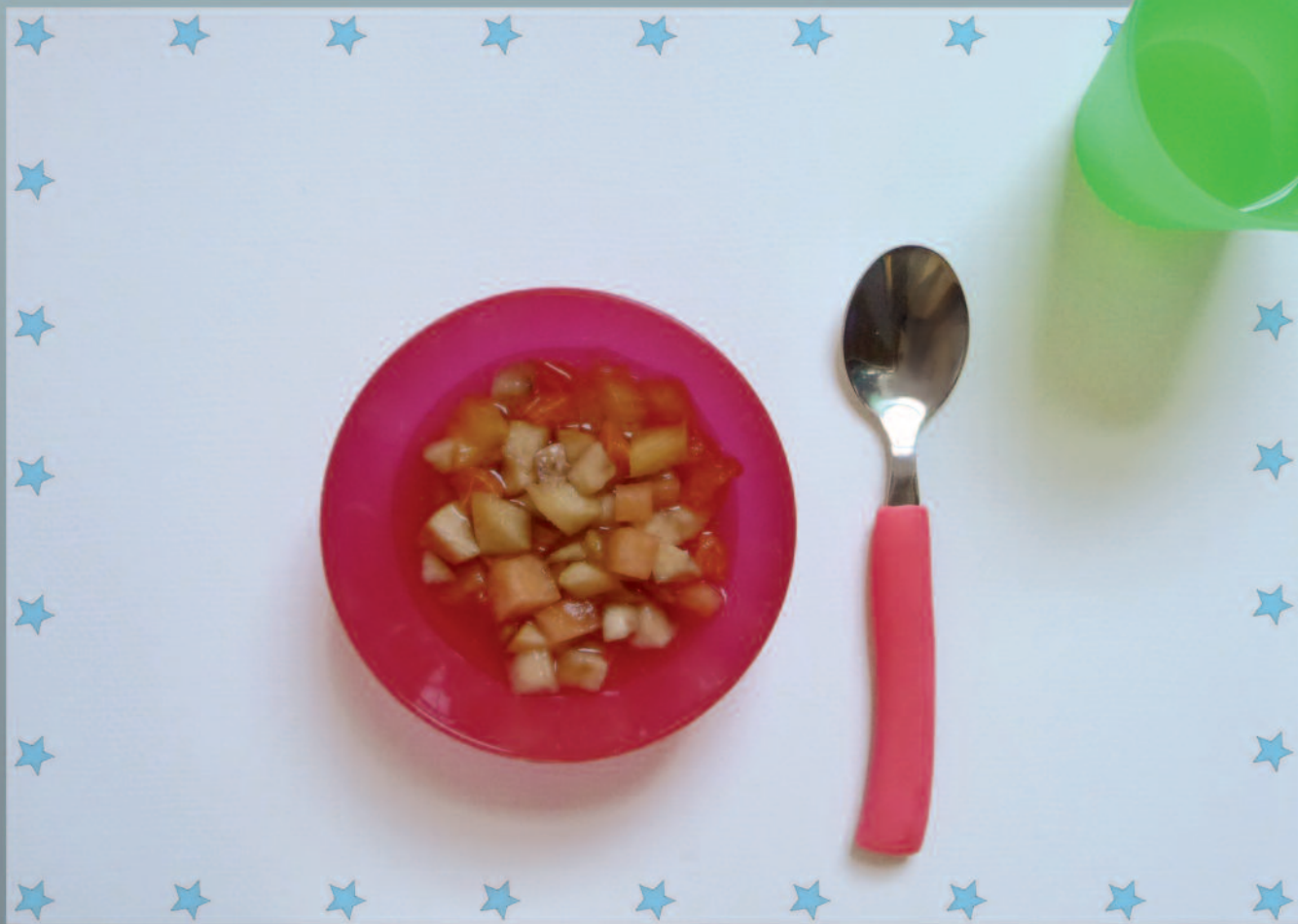
DESSERT Fresh fruit salad