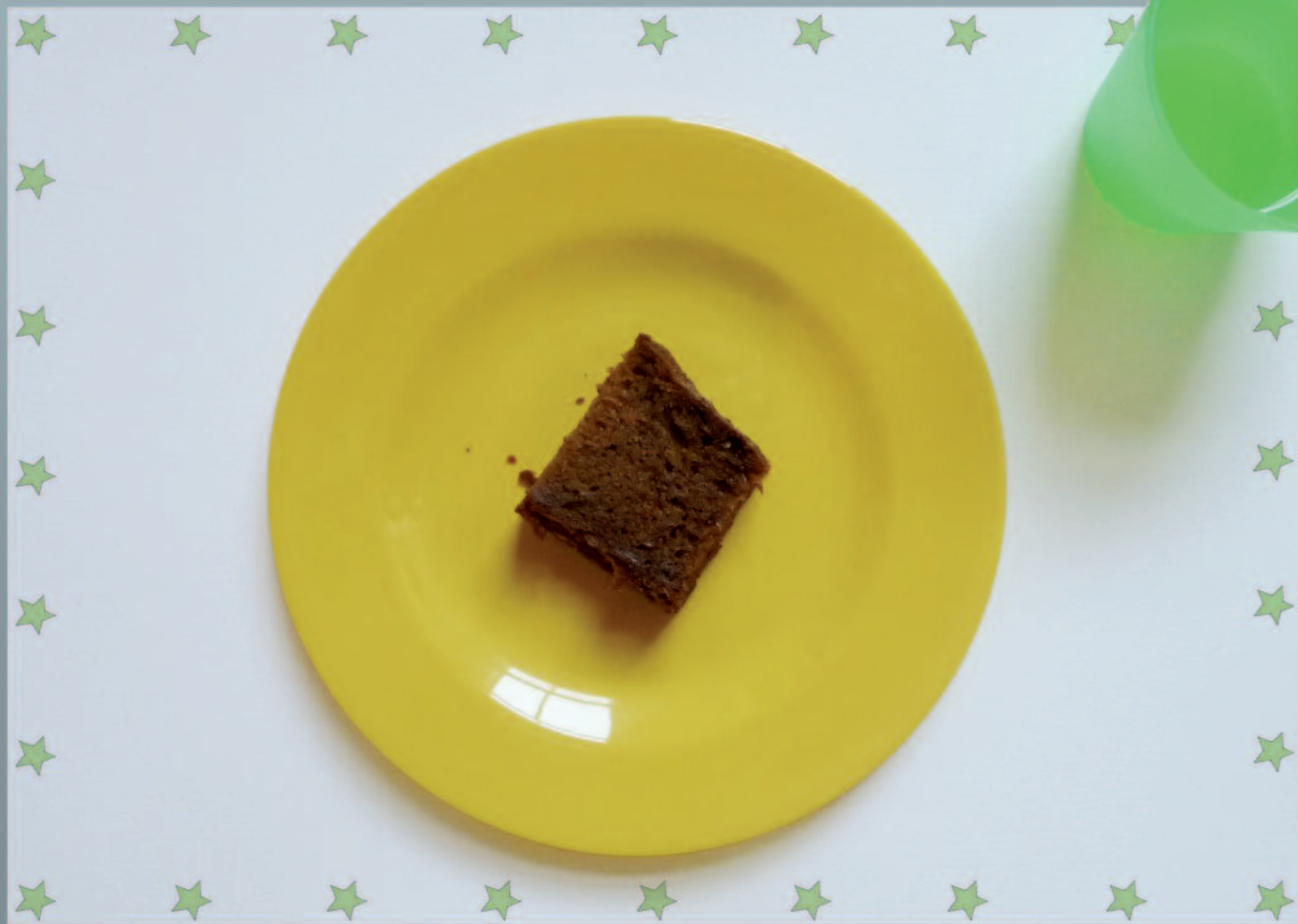
DESSERT Carrot cake