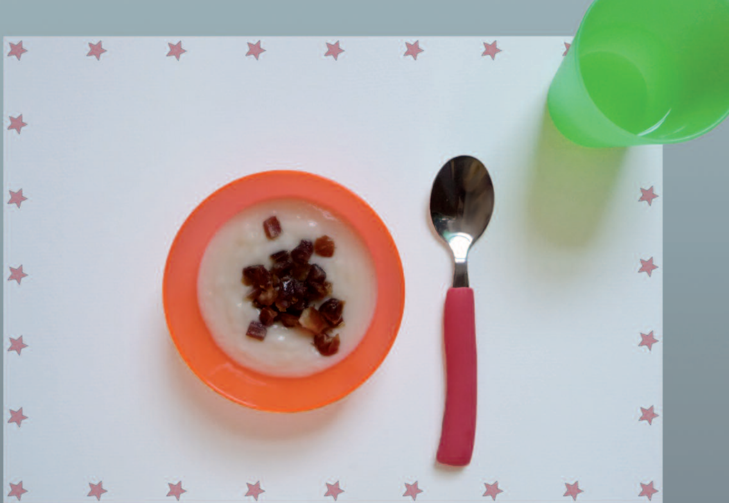
DESSERT Semolina pudding with chopped dates