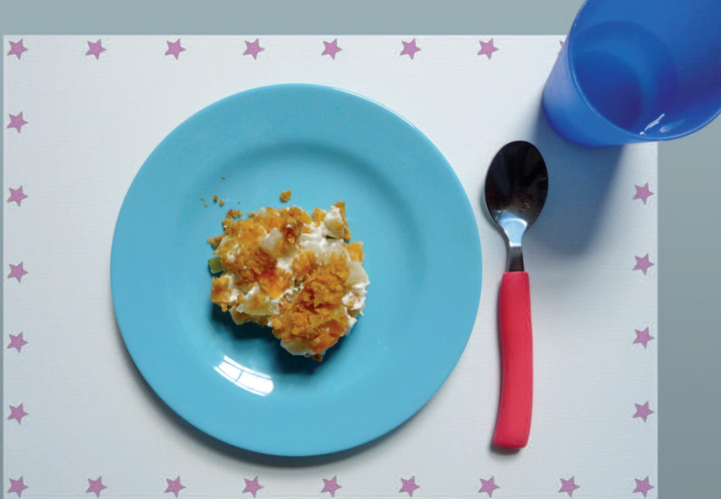
DESSERT Crunchy apricot and pear layer