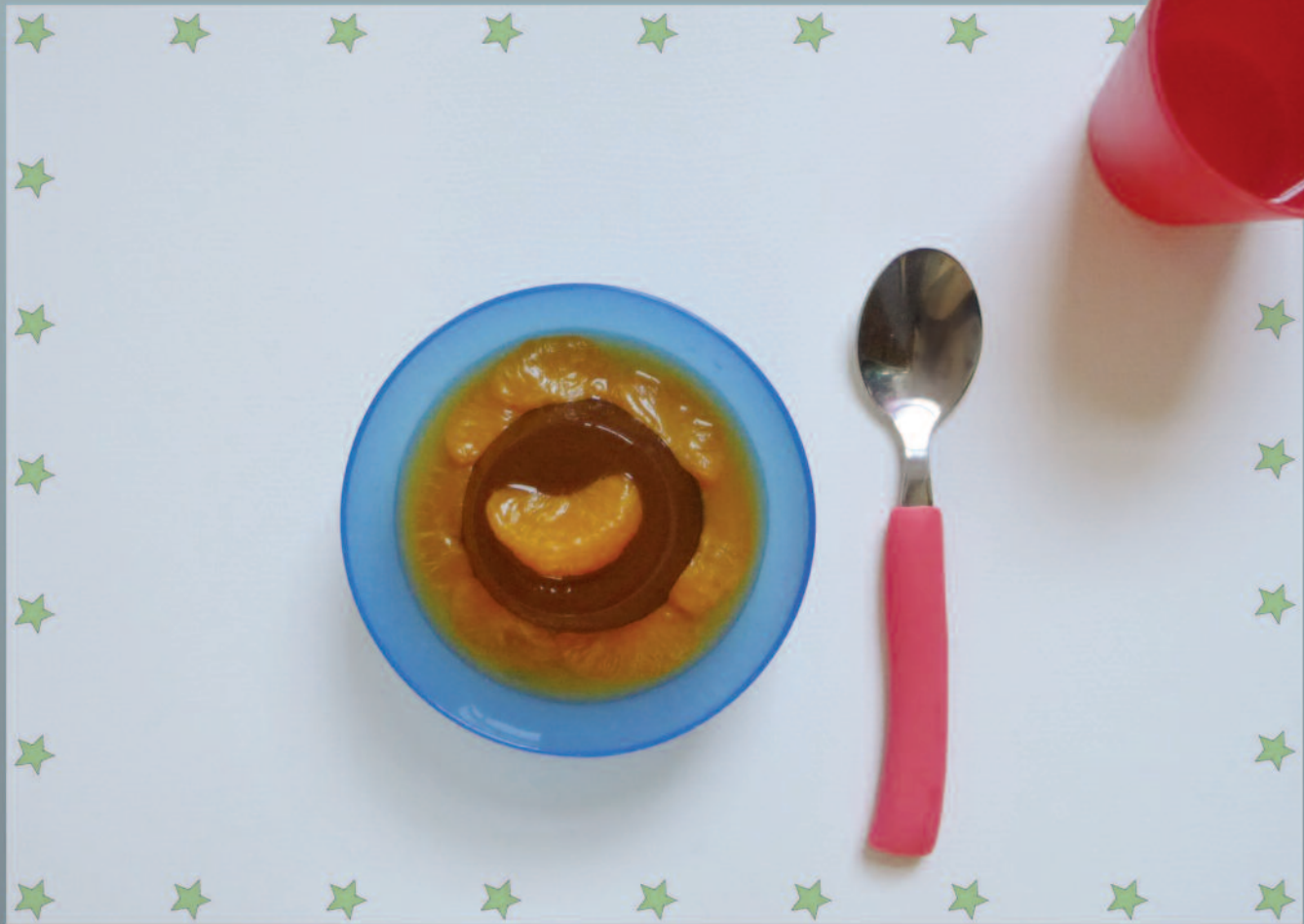
DESSERT Orange jelly with mandarins