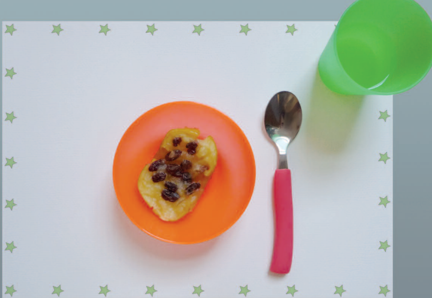
DESSERT Baked apple