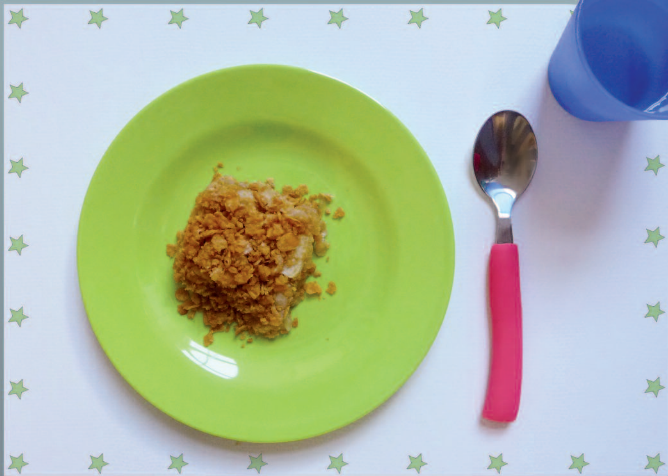
DESSERT Crunchy apple bake