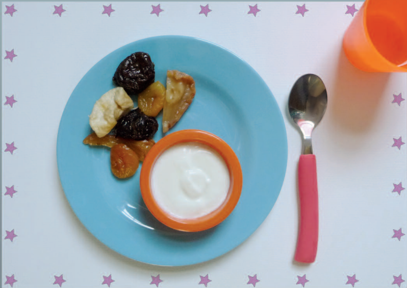
DESSERT Stewed fruit with Greek yoghurt