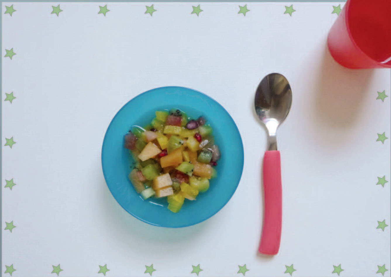
DESSERT Chinese fruit salad