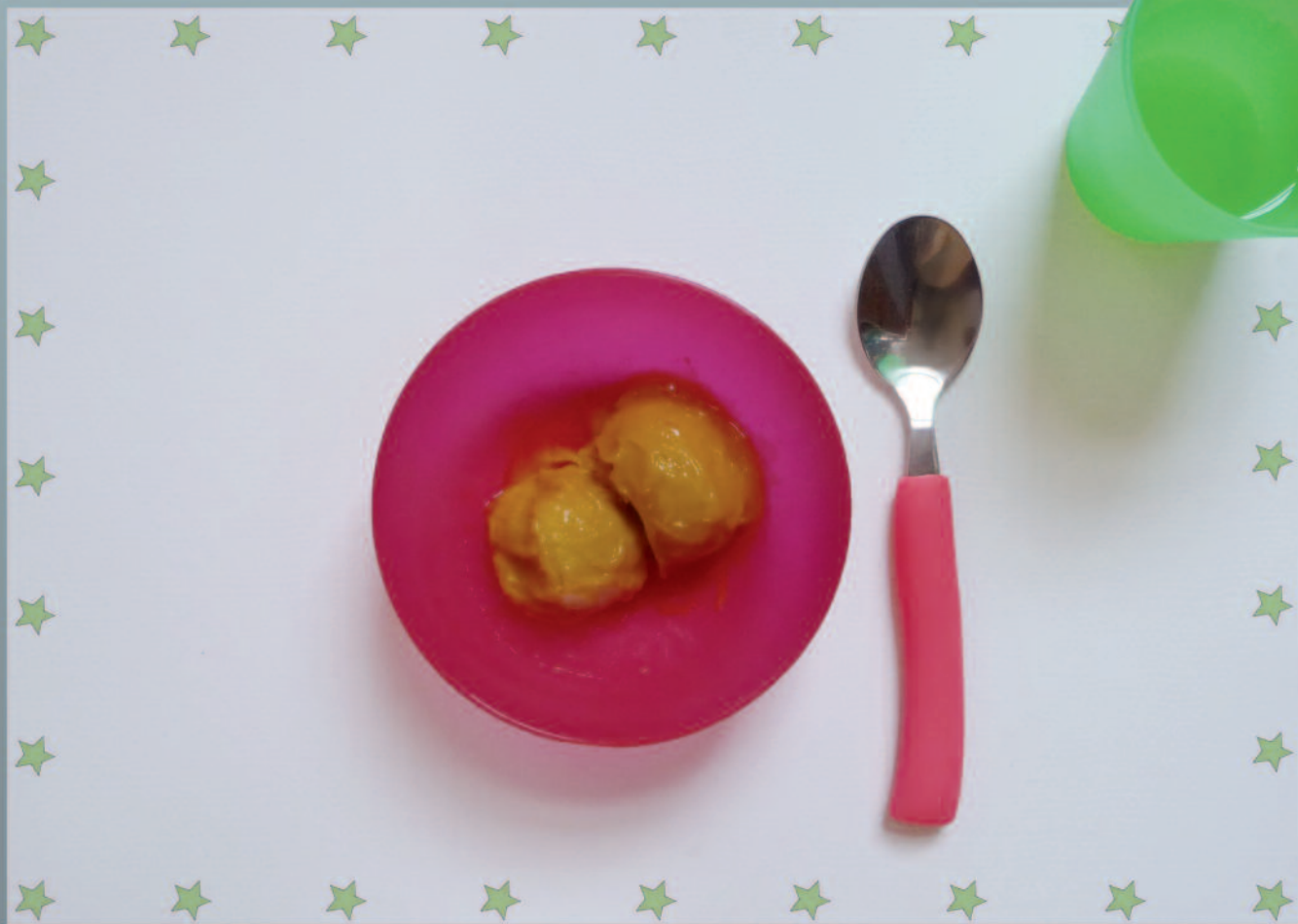
DESSERT Mango sorbet