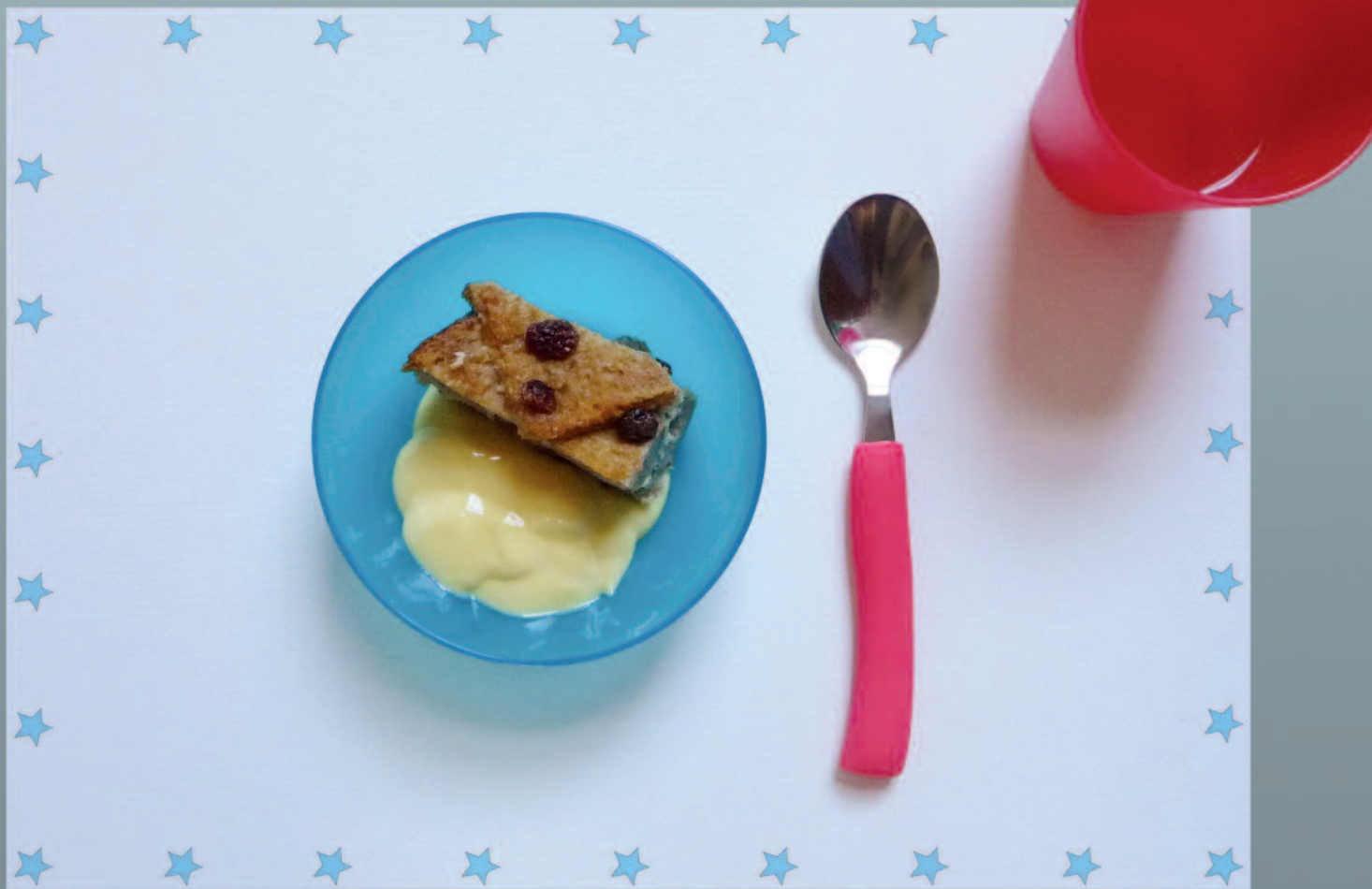
DESSERT Bread and butter pudding with custard