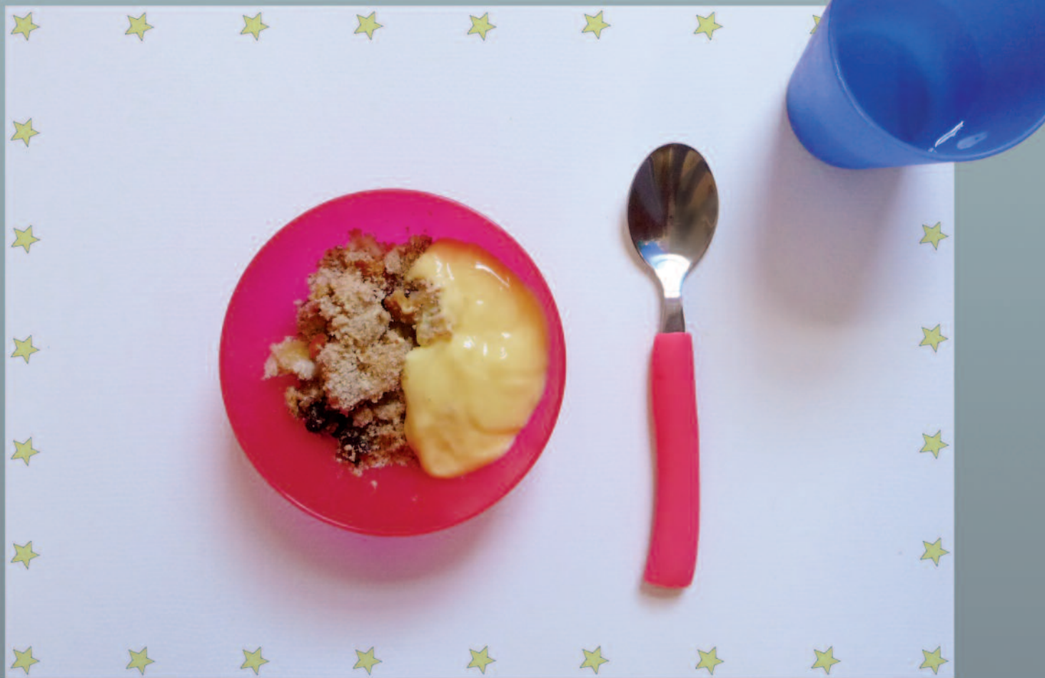
DESSERT Rhubarb crumble with custard