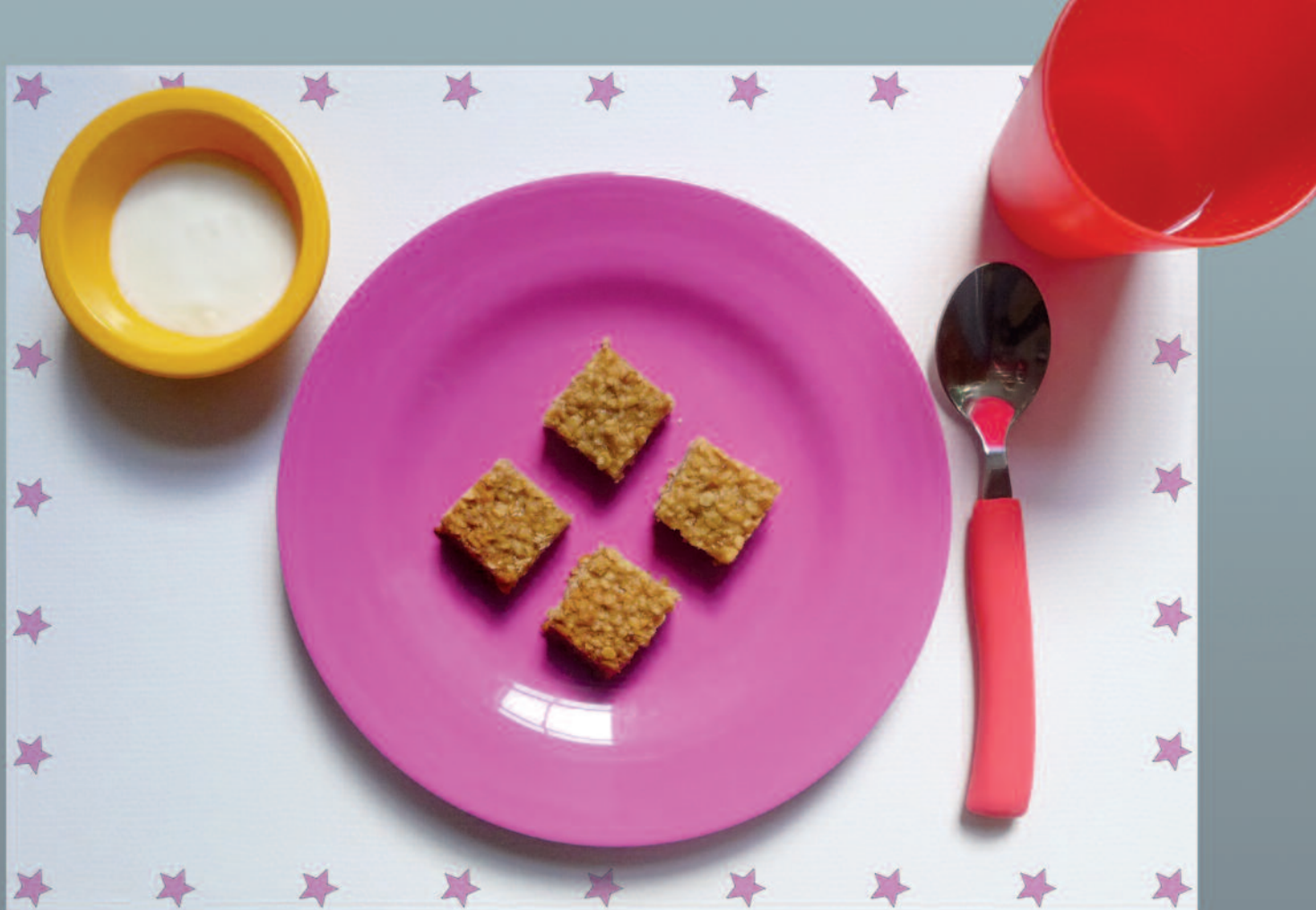
DESSERT Banana flapjack with yoghurt (for dipping)